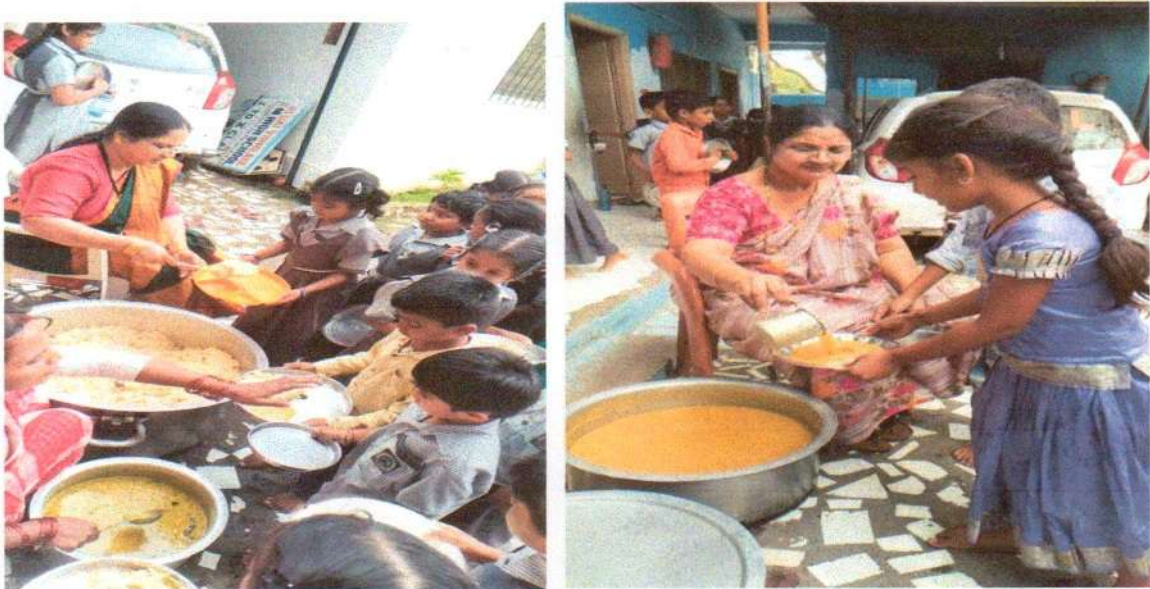
*Children in the school being served a nutritious meal.

Most of the parents of children from our school are daily labourers; they leave home early to work and return home late in the evening. Feeding their children with a nutritious meal is a difficult job for them. Due to which many children are underdeveloped physically and are under nourished. In order to prevent this, the school provides the children with a nutritious and healthy meal everyday in the school premises.