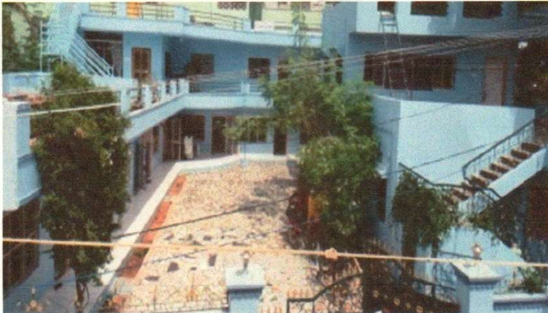
*School Premises of Sri Sai Vidyalaya.

Sri Sathya Sai district is one of the most backward districts with draughts and inadequate rainfall every year. With lack of employment and lack of opportunities to earn minimum basic income, even the people in villages find it hard to earn their daily bread & butter and migrate to other cities in search of work with an aim for a better livelihood. The literacy rate is at its lowest in the rural areas, 30-40% of the children are either uneducated or they drop out in primary school after 4th-5th class. As a result, they are largely isolated from mainstream society, unemployed and lead poor quality of lives. In order to develop and improve their lives by making them self dependent in the most effective way is through education.